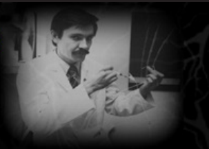
EXHIBIT SPACE PACKAGES

EMORY PRACTICAL INTERVENTION COURSE - SOUTHEASTERN CONSORTIUM (EPIC-SEC)